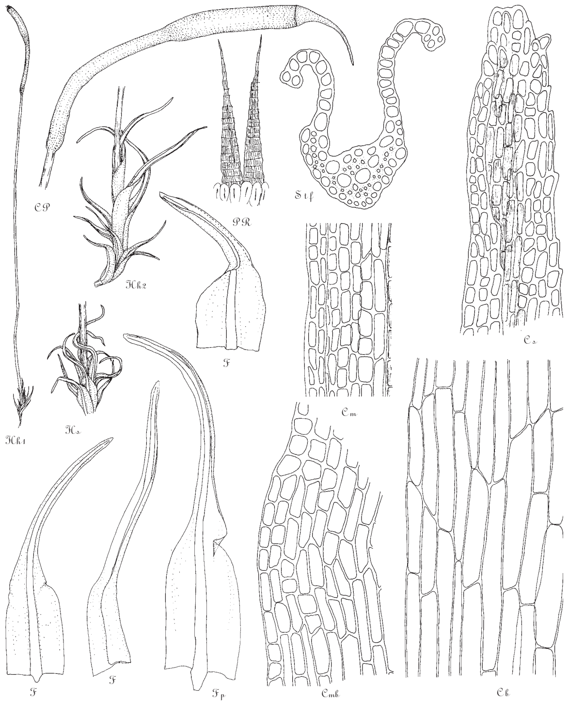
Trematodon longicollis Michx.