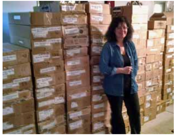
Fig. 1. Map of the study area in Wyoming. Shoshone National Forest: 1 - Beartooth Plateau; 2 - SW Absaroka Range; 3 - E Wind River Range. Medicine Bow National Forest: 4-6 - Medicine Bow Mts., including Snowy Range (5); 7 - Laramie Range; 8 - Pole Mts. Fig. 2. The author and her herbarium of the Wyoming bryophytes.

Forest (Figs. 1-2). The former lies in the northwest corner of Wyoming in the lee of the massive Absaroka and Wind River Ranges and Beartooth Plateau (Central Rockies); the latter embraces mountains in the southeastern portion of the state: Sierra Madre, Pole Mts., Laramie Range and Medicine Bow Mts., including the peaks of Snowy Range (Southern Rockies). The study area spans about 13700 km 2 and ranges in elevation from approx. 1700 to over 3650 m. Four elevation zones can be generally delimited here: 1) the foothills (from 1700 to approx. 2100 m; semi-arid zone of sagebrush grasslands and shrublands / scrublands dominated by Artemisia tridentata Nutt., Cercocarpus spp., Purshia tridentata (Pursh.) DC., etc.); 2) the montane zone (approx. 2100-2600 m; the middle-altitude, relatively dry forested zone, with a wide expanse of pine ( Pinus contorta Dougl. ex Loud. var. latifolia Engelm. ex Wats., P. flexilis James and P. ponderosa Laws. & Laws.), Douglas-fir ( Pseudotsuga menziesii (Mirb.) Franco var. glauca (Beissn.) Franco) and aspen ( Populus tremuloides Michx.); 3) the subalpine zone (approx. 2600-3050...3300 m; spruce-fir ( Picea engelmannii Parry ex Engelm. - Abies