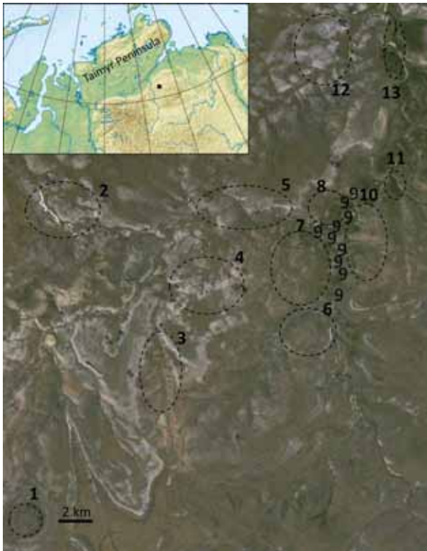
Fig. 1. Collecting localities (according to Table 1).

On Eriechka River terraces and in wet hollows in the lower part of watershed slopes swampy larch stands with Betula exilis , Eriophorum russeolum , E. vaginatum , Rubus chamaemorus , Pedicularis lapponica , Vaccinium minus occur. Dicranum elongatum , D. laevidens , Aulacomnium acuminatum , A. palustre , Oncophorus wahlenbergii , Sphenobolus minutus are most common on the hummocks, while in depressions Tomentypnum nitens ,