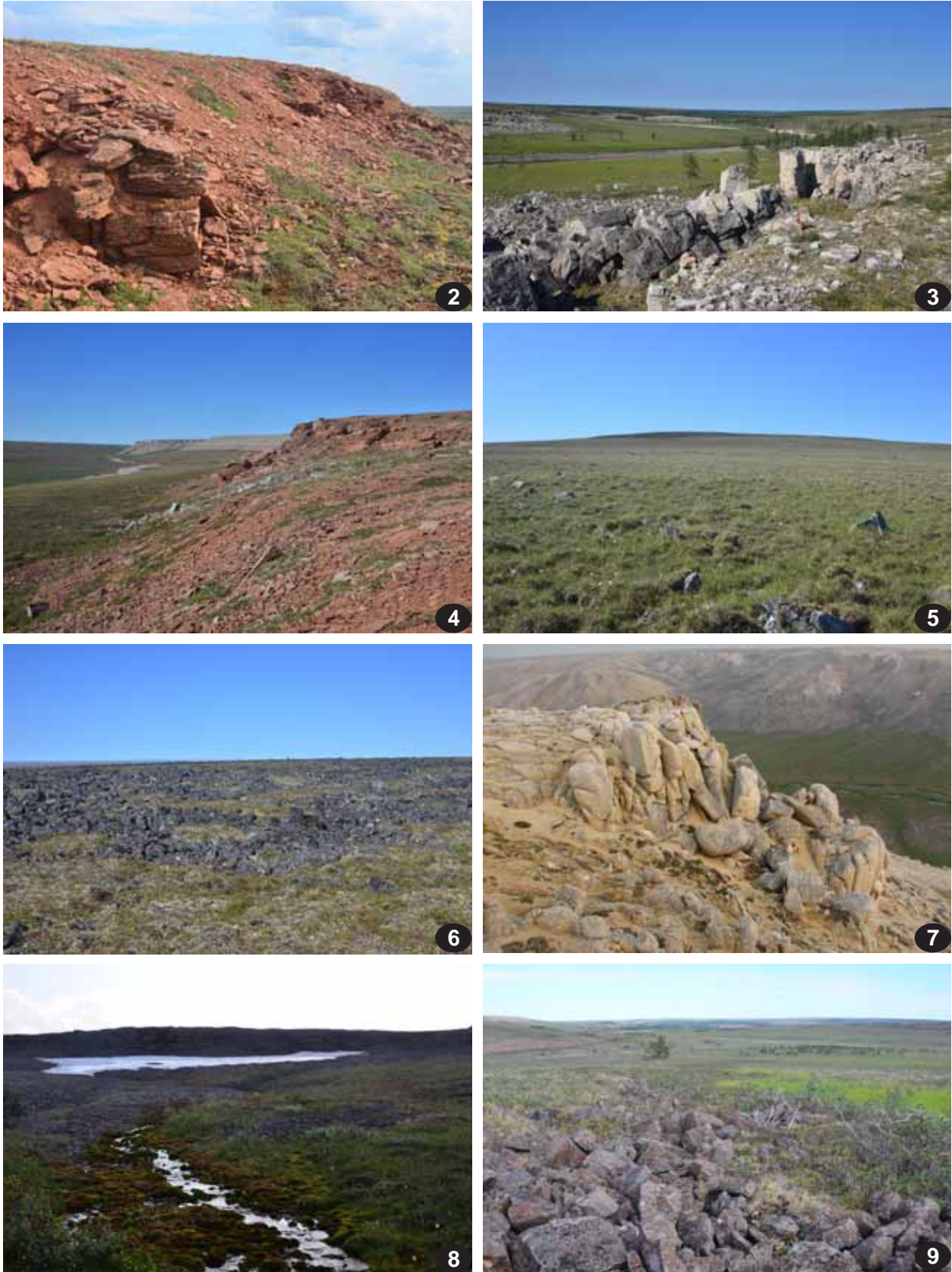
Figs. 2-9. 2 – red marl outcrops; 3 – Proterozoic limestones in the valley of Eriechka River upper course; 4 – red marl outcrops and Cambrian dolomites; 5 – Nyamakit Mt.; 6 – ijolite rock field on the top of Nyamakit Mt.; 7 – Cambrian dolomite outcrop; 8 – moss-dominated community below snow-field; 9 – dolerite rock-field.