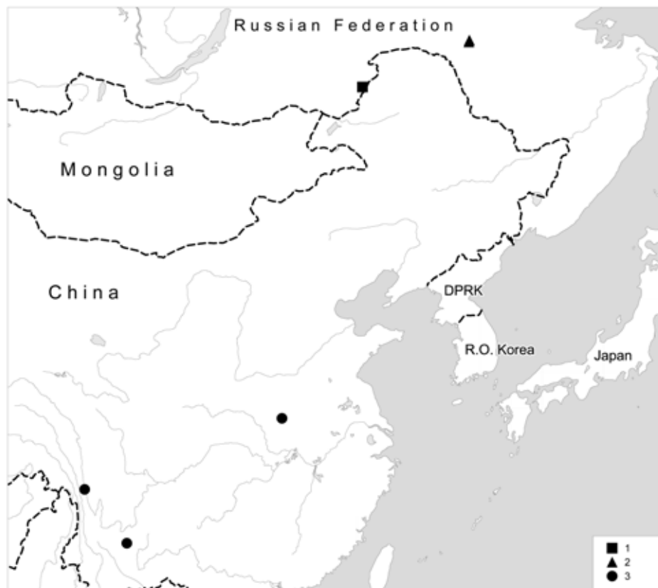
Fig. 2. Distribution of Fabronia rostrata Broth. 1 – locality in Zabaikalsky Territory; 2 – locality in Amurskaya Province; 3 – localities in China (from Gao & Fu, 2002).

it was collected at 400–650 m a.s.l., on rock in the forest and on Tilia amurensis trunk.