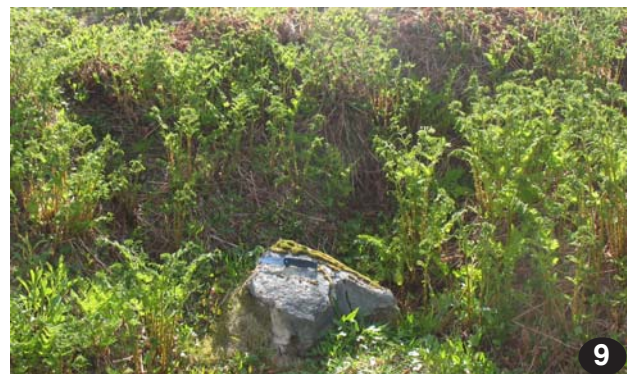
Figs. 2–9. The Ainov Islands. 2. Tundra-like community with domination of Empetrum nigrum and Rubus chamaemorus ; 3. Sedge ( Carex aquatilis ) swamp with Sphagnum squarrosum and S. riparium ; 4. Eutrophic swamp with Caltha palustris , Angelica archangelica and Anthriscus sylvestris (forefront) and willow ( Salix glauca ) stand (second place); 5. Rocky coastal meadow with Rhodiola rosea , Honckenya peploides , Festuca richardsonii and Sanionia uncinata ; 6. Tallgrass community of Angelica archangelica and Anthriscus sylvestris with Plagiomnium ellipticum , Sciuro-hypnum reflexum and S. curtum ; 7. The lyme grass ( Leymus arenarius ) tussock fields; 8. Groups of Rumex acetosa s.l. near the burrow entrances in the Atlantic puffin rookery; 9. A stone with epilithophyte mosses among fern ( Dryopteris expansa ) meadow.