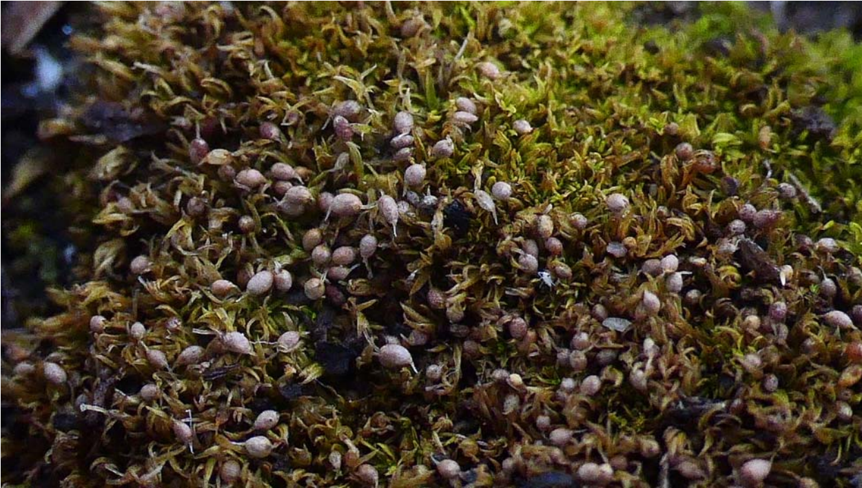
Fig. 1. Habit of Weissia exserta (Russia, Buryatia, foothills of Tunkinskie Goltsy Range, Mondy Settl. outskirts).

tion between Japanese Weissia was supposed by Inoue & Tsubota (2017) to be responsible for the origin of two endemic Japanese species with cleistocarpous capsules. However, the second specimen of W. exserta has a different rps4 sequence. Finally, rbcL found no identical specimens in an available for comparison Asian selection of taxa, and it suggests higher similarity of specimen from Mondy settl. outskirts with Asian lineages of W. controversa rather than with W. exserta ; the latter species represented by two Japanese accessions has clear molecular synapomorphies, which differentiate its sequences from one obtained from our specimen.